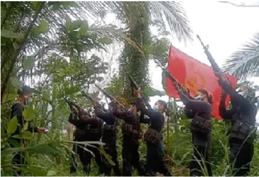
NPA fighters from Central Luzon take in their a 21-gun salute for Ka Joma

prohibition against foreign military bases and forces in the Philippines by making the Enhanced Defense Cooperation Agreement to allow the US military forces to have exclusive bases and facilities within the camps and military reserve areas of the reactionary armed forces. But now, the US is conspicuously locked in a contest with China to plunder the natural resources of the Philippines and the rest of ASEAN.